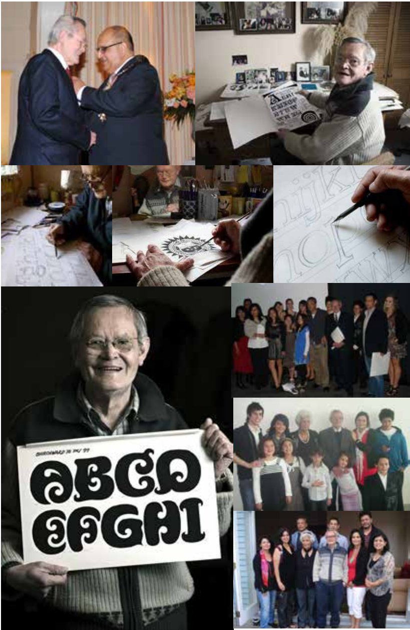
Typeface: Churchward Legible